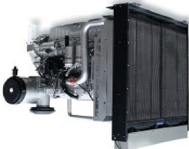
Perkins heavy duty high performance industrial type diesel engine.